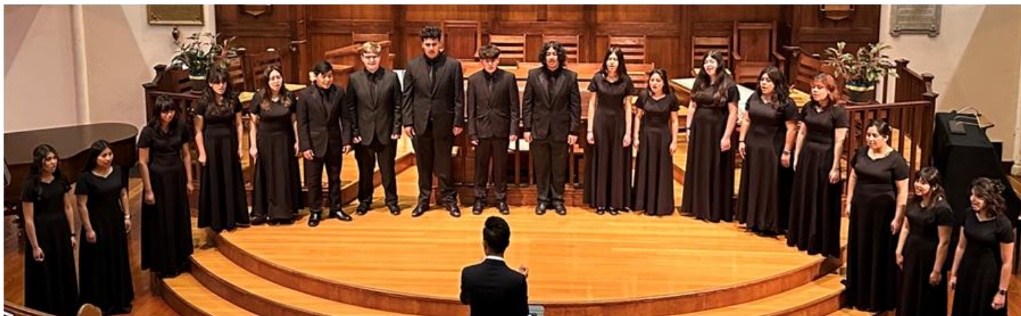
Rubidoux High School Choir - Jurupa Valley, California