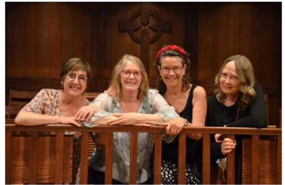
Lafayette Quartet, members

Come and enjoy the chamber music; everyone is welcome.