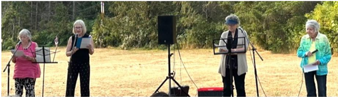
Conformed by Fear – Transformed by Faith - Women at the Riverside – telling the story of Moses.