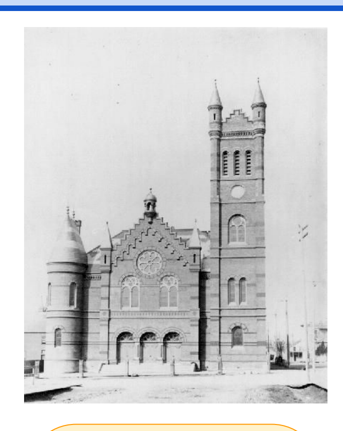
In Loving Memory of

If you are interested in a tour of the building, stop by on Wednesdays for Open Church from 12 - 1 pm. If you are curious about an aspect of the church's history, or have an interesting historical story to tell, please contact the office to have your question/story featured here!