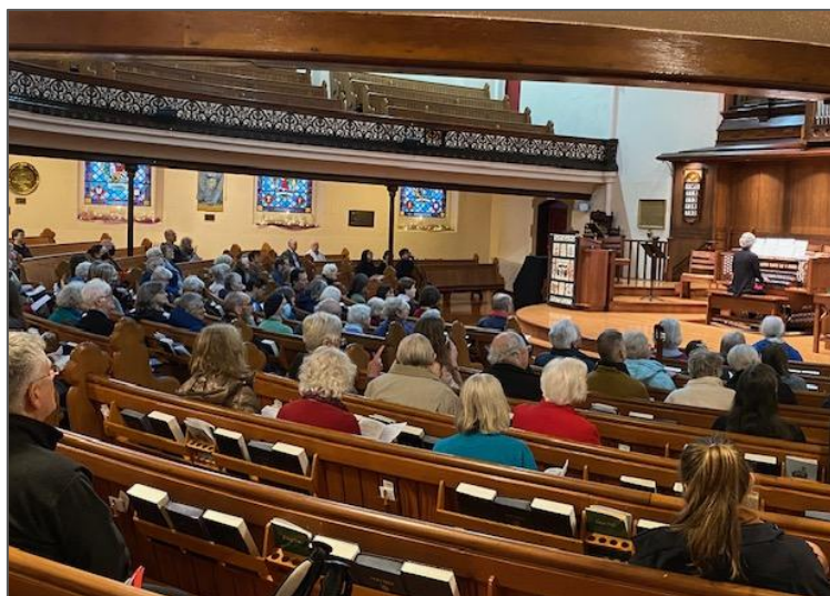
Audience members at The Gift of Christmas Music Concert on December 14, 2023.

The new Branding Logo will be placed on all the following: letterhead, envelopes, business cards, epilogues, service bulletin, posters & handouts, The Link, TWASA, website, Facebook, YouTube Channel, Annual Report, sandwich board for outside the church each Sunday, Open Church and Wednesday Meditation, pew bookmarks, pew offering envelopes, and parking passes.